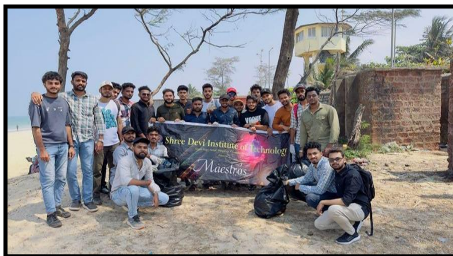
Cleanliness drive at Panambur Beach on 23 rd February 2023

The primary objective of this initiative was to promote environmental awareness, engage the local community in preserving the coastline, and contribute to the overall well-being of the marine ecosystem, the Beach Cleaning Drive was initiated on 23 rd February 2023 at 8:30 AM. All final year students of Mechanical Engineering gathered for the beach cleaning activity. The event emphasized the importance of collective responsibility in maintaining a clean and healthy environment. The beach cleaning activity at Panambur beach was a resounding success, thanks to the dedication and enthusiasm of students. By coming together to clean up our beaches and raise awareness about the importance of environmental conservation, we have taken a significant step towards protecting our coastal ecosystems, preserving marine biodiversity, and fostering a culture of sustainability for future generations to enjoy.