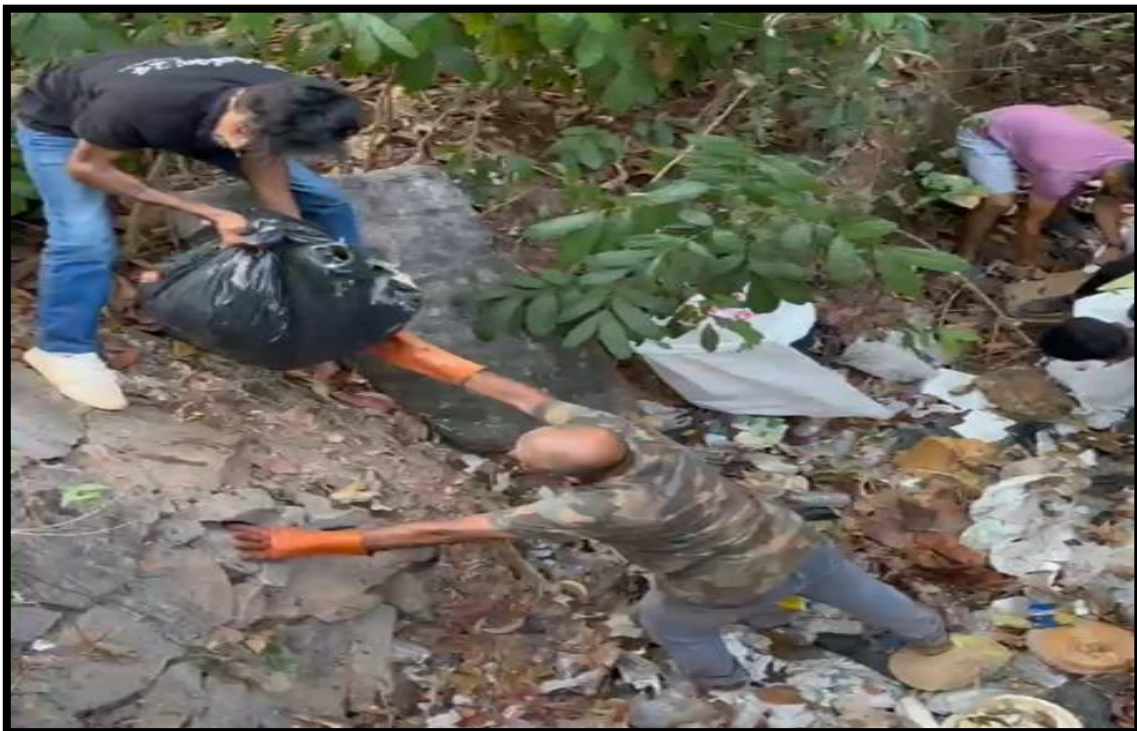
Eco-Study tour & Cleanliness drive at forest area located in Kanthvara on 15 th December 2022