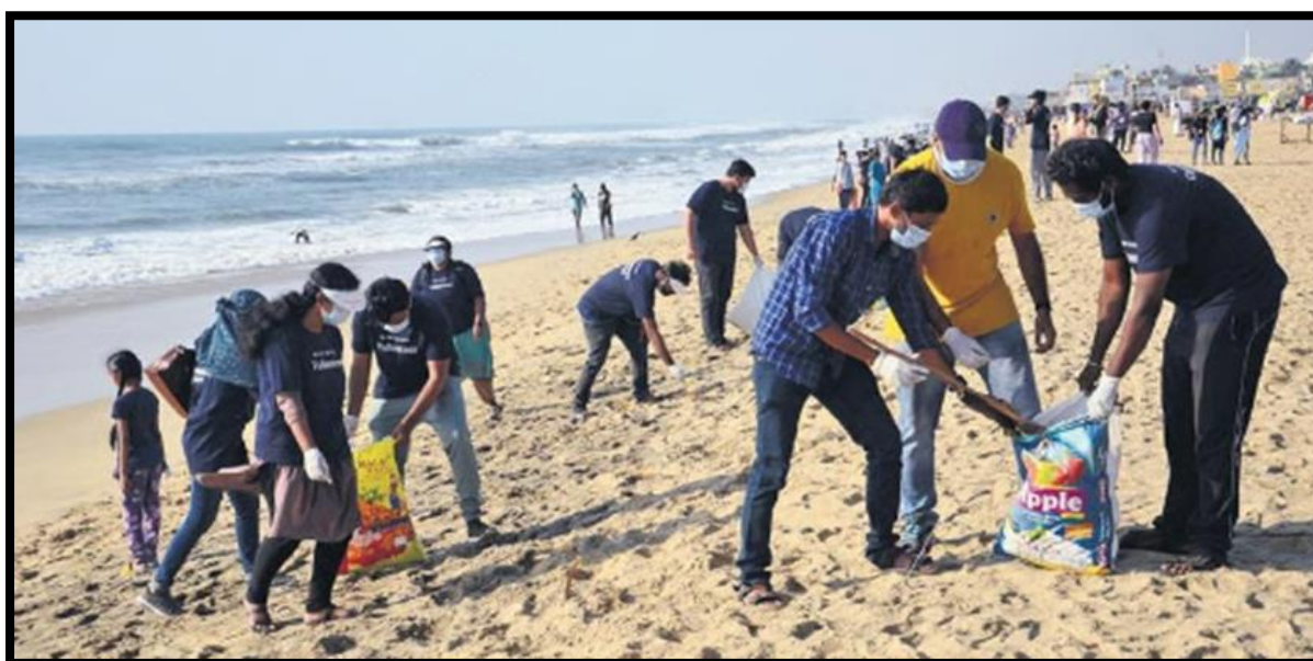
Cleanliness drive at Padubidri Beach on 29 th December 2022

The primary objective of this initiative was to promote environmental awareness, engage the local community in preserving the coastline, and contribute to the overall well-being of the marine ecosystem. All students of E&CE gathered for the beach cleaning activity. The event emphasized the importance of collective responsibility in maintaining a clean and healthy environment. The beach cleaning activity at Padubidri beach was a resounding success, thanks to the dedication and enthusiasm of students. By coming together to clean up our beaches and raise awareness about the importance of environmental conservation, we have taken a significant step towards protecting our coastal ecosystems, preserving marine biodiversity, and fostering a culture of sustainability for future generations to enjoy.