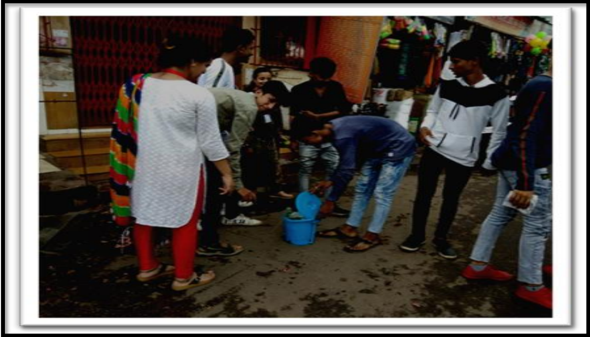
Cleanliness drive by students of SDIT from Maravoor to Bajpe on 6 th October 2021

(Approved by AICTE, New Delhi, Affiliated to Visvesvaraya Technological University, Recognised by Govt. of Karnataka)