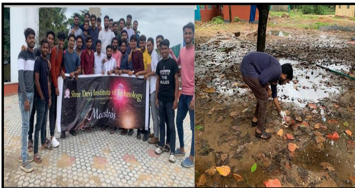
Cleanliness drive at Kenjar on 15 th September 2021

Nearly 30 students accompanied by 2 staff took part in this initiative. They also ensured that dry and wet waste was correctly separated in accordance with recycling requirements and that waste was disposed of properly. The plan was explained to the residents and promoted awareness of the need for public sanitation maintenance.