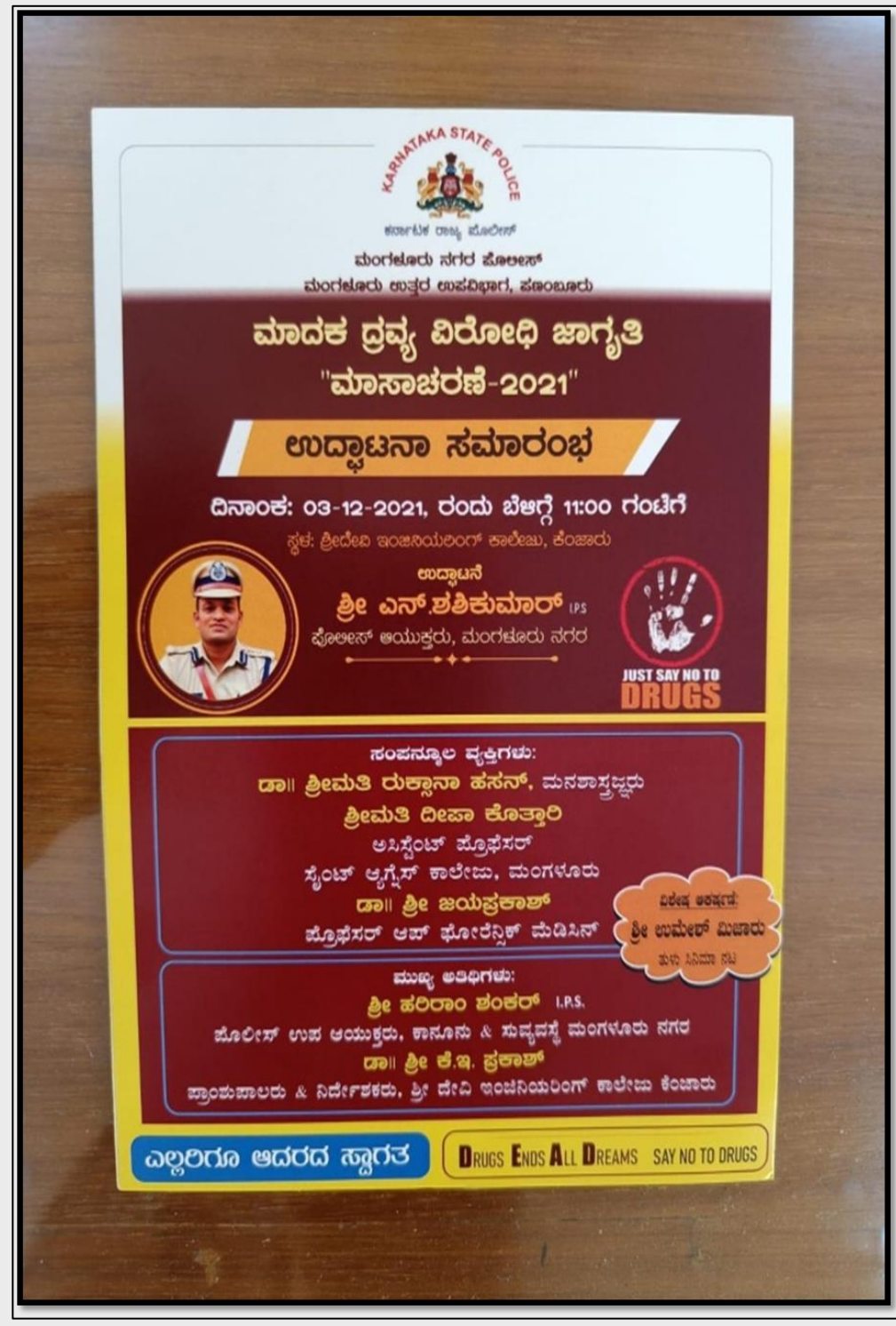
Invitation of programme

(Approved by AICTE, New Delhi, Affiliated to Visvesvaraya Technological University, Recognised by Govt. of Karnataka)