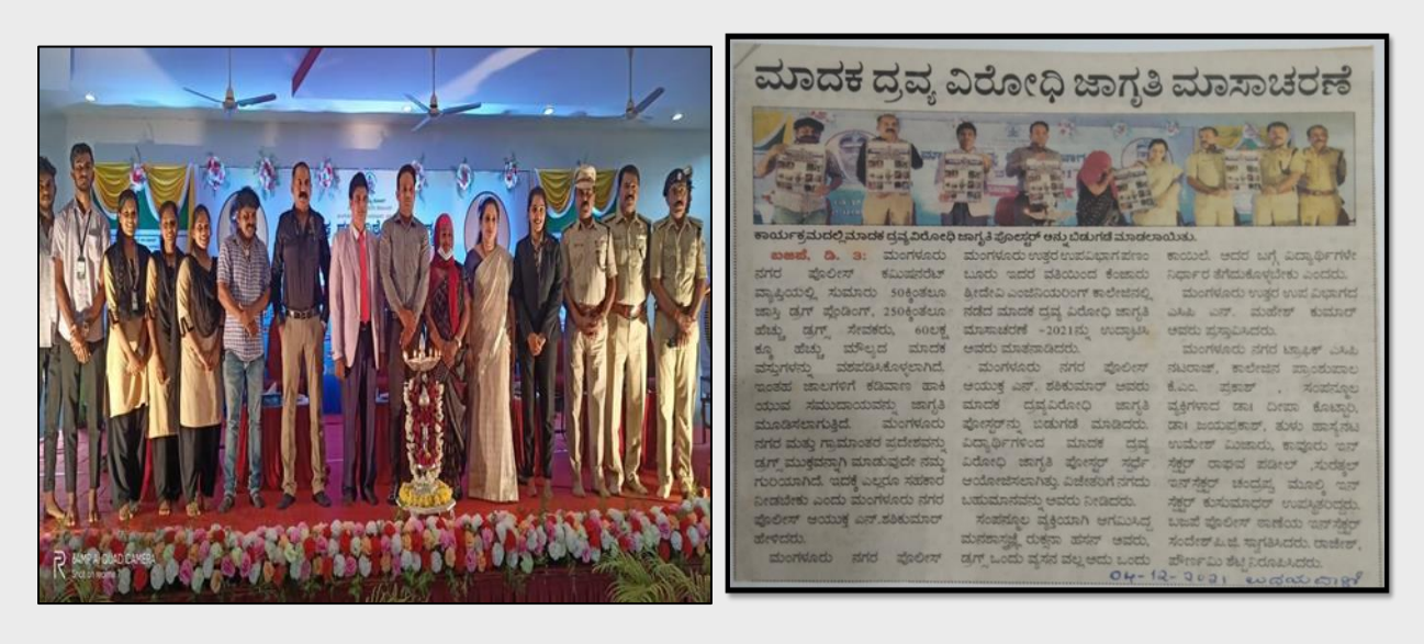
Inauguration of programme